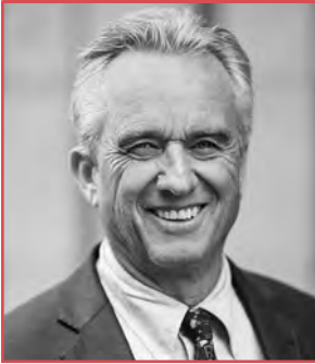
Robert F. Kennedy, Jr., JD